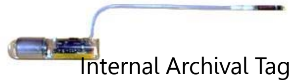
Internal Archival Tag