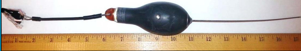
Electronic PSAT Tag